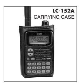
Helps protect the transceiver from scratches, etc. Fits any battery pack.